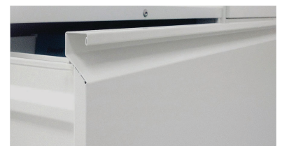
J HANDLE DETAIL