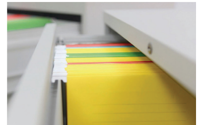
LETTER OR LEGAL SIZE FILING