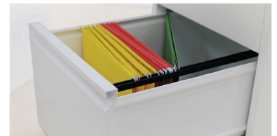
HANGING FILE BAR INCLUDED