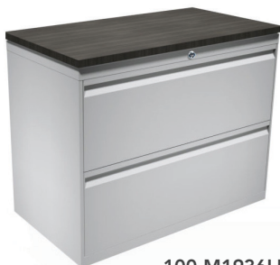
100-M1936LF WITH TTN-1936TOP-GD

These optional tops are available in Autumn Maple (AM), Hardrock Maple (HM) and Grey Dusk (GD)