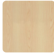
Hardrock Maple HM