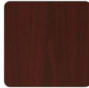
Royal Mahogany RM