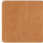
Sugar Maple SM