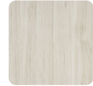
Winter Wood WW