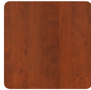
Autumn Maple AM