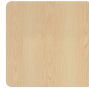
Hardrock Maple HM