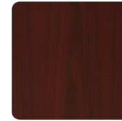
Royal Mahogany RM