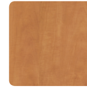
Sugar Maple SM