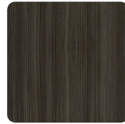
Grey Dusk GD