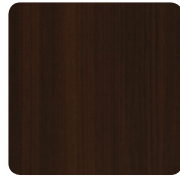
Evening Zen EZ