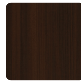
Evening Zen EZ