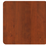
Autumn Maple AM