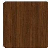
Black Walnut BW