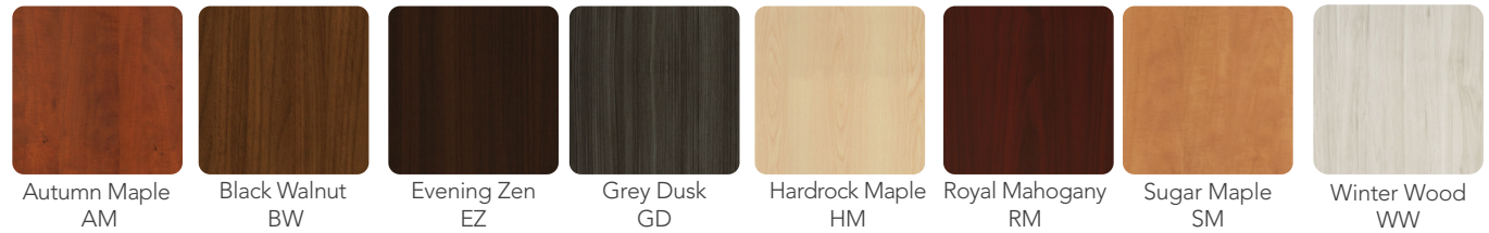
Autumn Maple AM