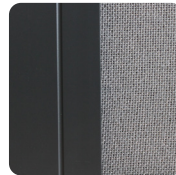
Charcoal Frame & Grey Panels